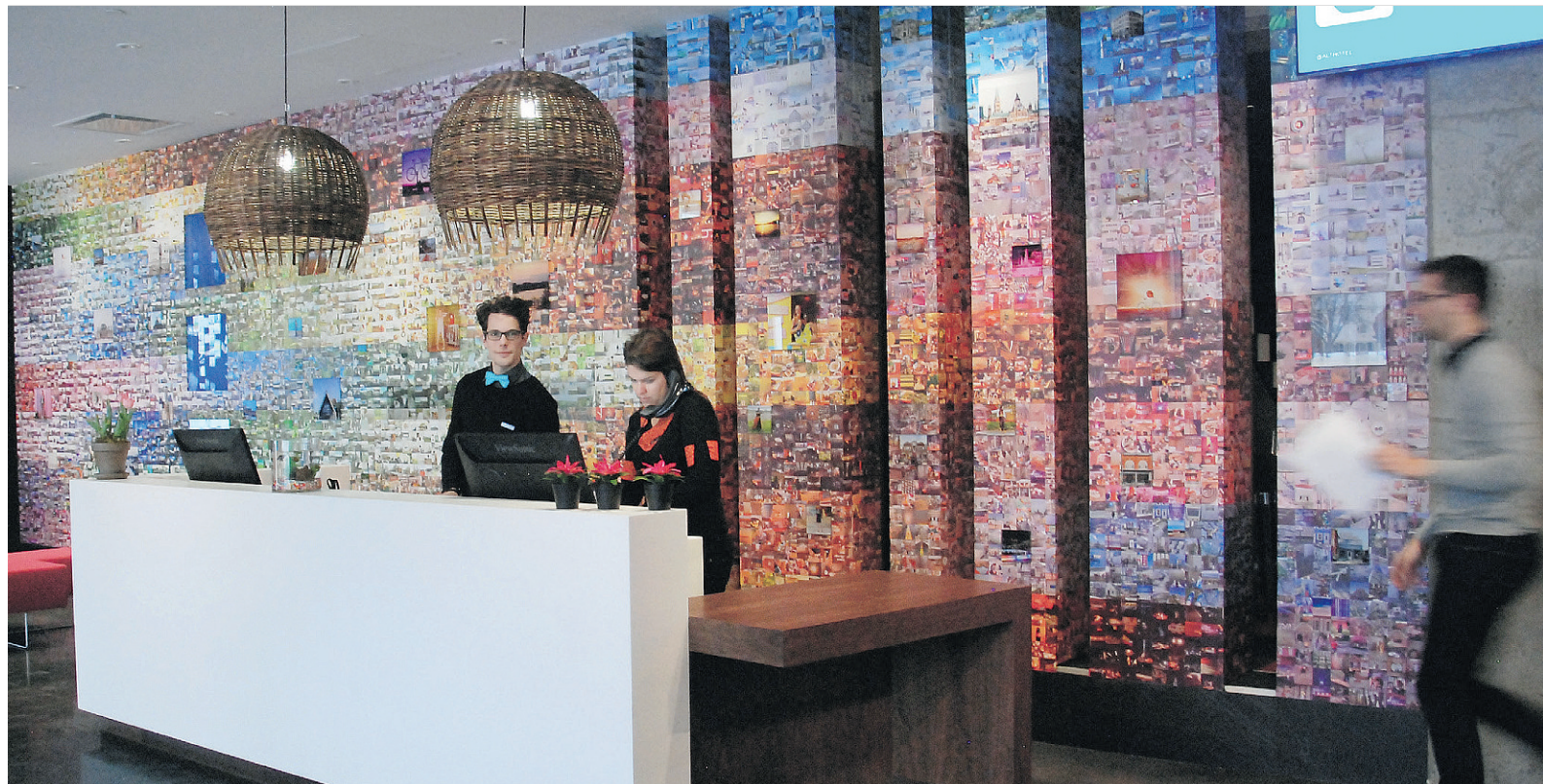
The new Alt Ottawa hotel, near Parliament Hill, is strong on avant-garde interior design.