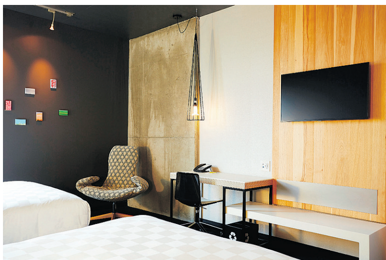
The 148 rooms at the Alt Ottawa have minimalist, design-centric decor and flat-screen TVs.

At the centre of Altcetara is a captivating bar that offers breakfast, lunch, supper and drinks. The new idea: Alt hotels typically